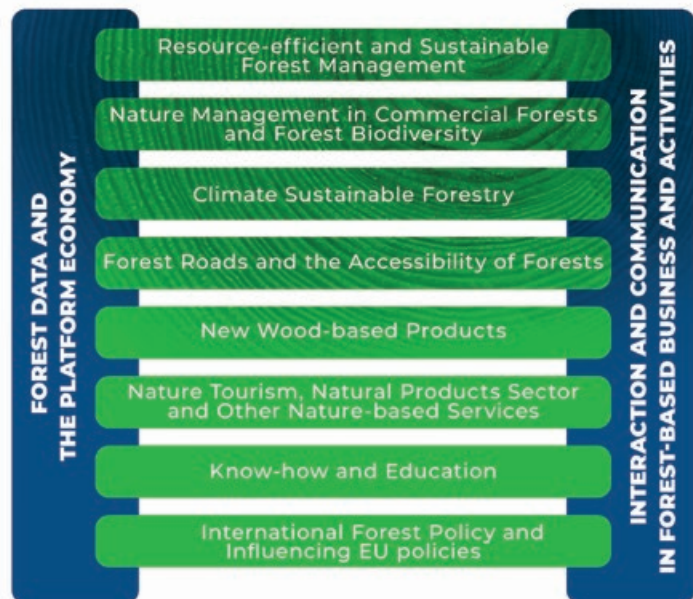
Figure: The Updated National Forest Strategy includes 10 strategic projects.