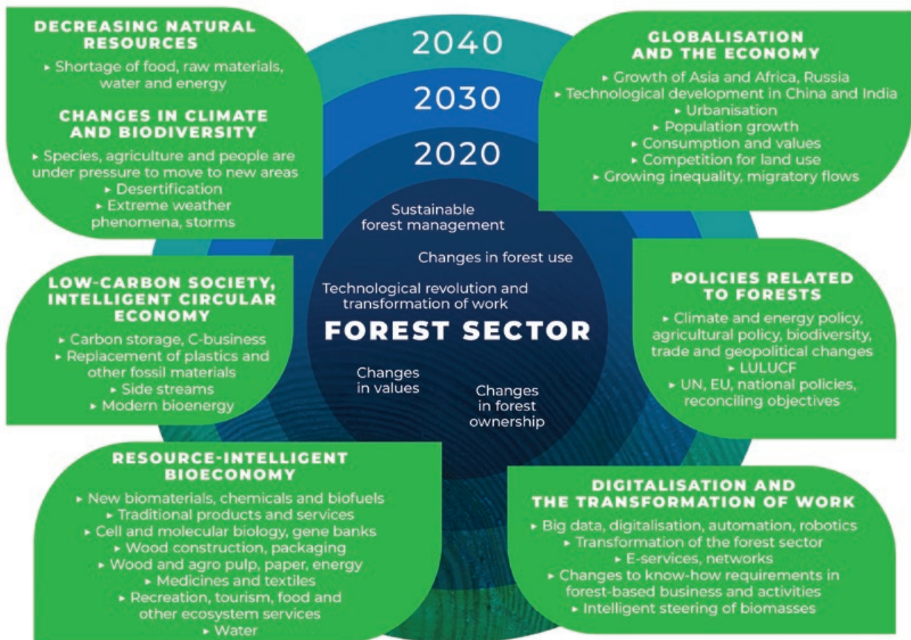
Figure: Key global megatrends that affect the forest sector.

Objectives related to sustainable development will influence the forest sector's development both in the short and long term. These are reflected in Finland's forest sector, for example, through the export of forest industry products, forest use as well as international policies that are related to and affect forests.